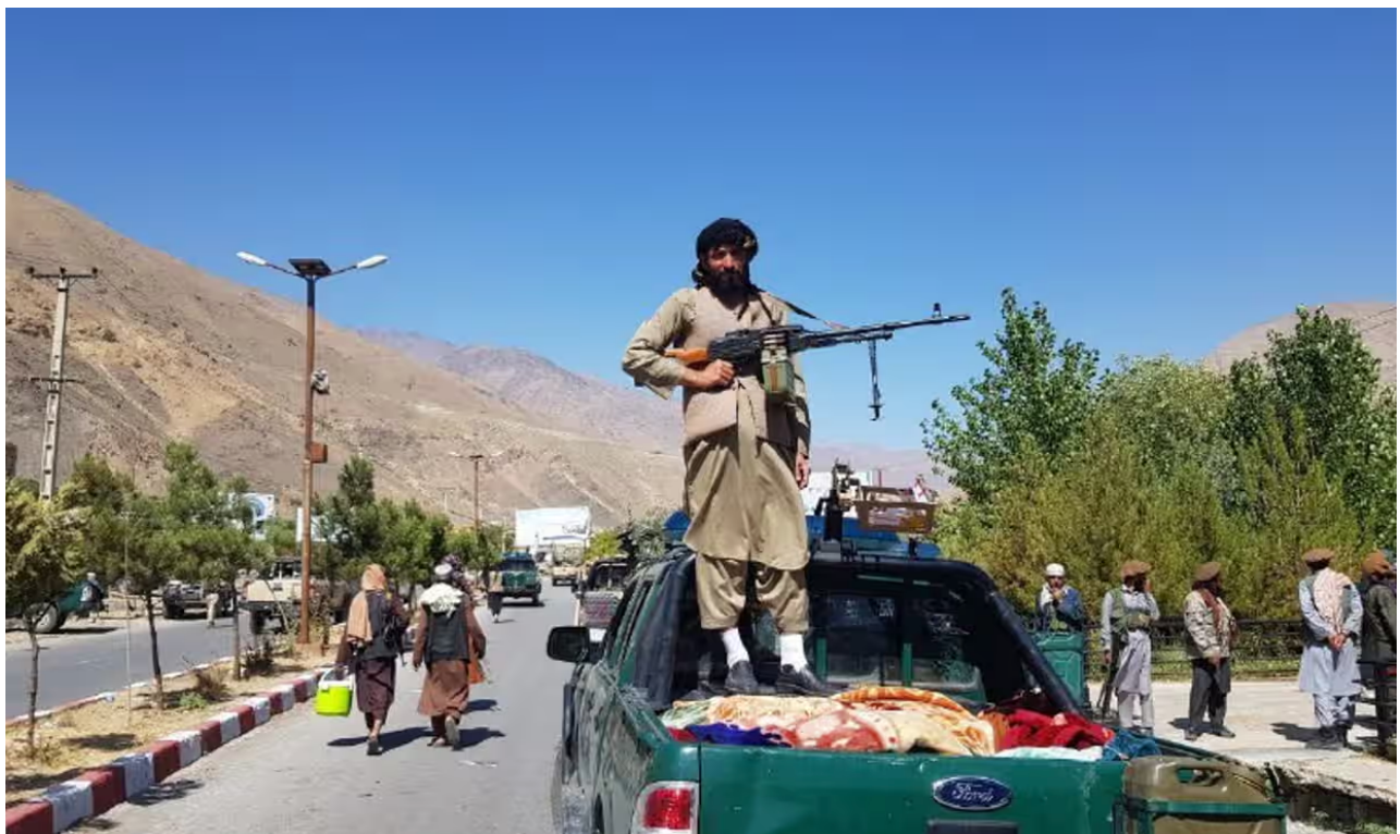
Taliban gunmen in Panjshir murdered 20 civilian protesters.

The Taliban believe that their government is representative of God’s authority in Afghanistan. Consequently, any opposition to their government equals hostility against God. The Taliban arrest and execute those who fight in resistance movements against their forces. When protesters in Panjshir province announced their disagreement with Taliban policies, the Taliban killed the protesters.