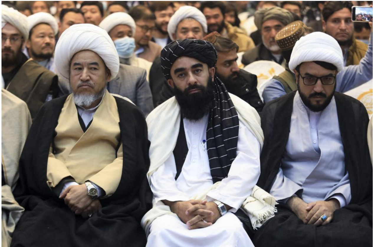
Zabiullah Mujahid, the spokesperson of the Taliban, joined in a religious summit of Shia leaders to give the false impression that the Taliban respect Shias.

Much of the West would like to believe that after tiring of their war against the Taliban and their abandonment of Afghanistan, somehow the Afghan people will eventually overthrow Taliban tyranny. Meanwhile how many lives will be lost? How many lives will be destroyed?