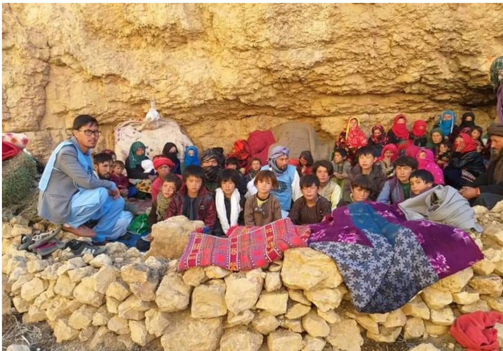
Taliban forbade Islamic burial of bodies of 150 Hazaras killed in Balkhab, Bamyán 2022

The soldiers said to the father of the girl that if he disagreed, the soldiers would rape his daughter and his wife. The soldiers told him that he had to force his daughter to get married immediately. They started beating me and they broke one of my legs. Our daughter is a victim of the Taliban’s crimes. I have no news about where she is now. What is she doing? Maybe she has committed suicide.”