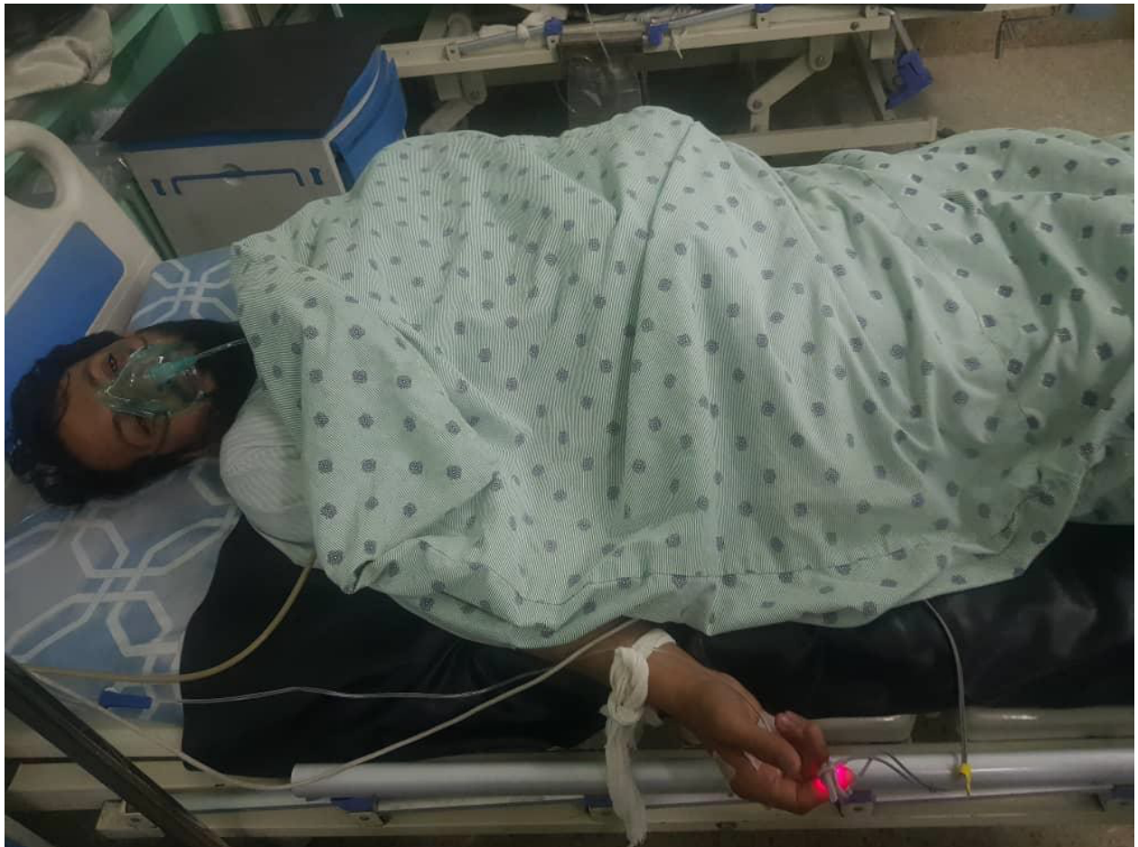
An Afghan journalist who was arrested and tortured by the Taliban.

"Their detective threatened to kill my wife and children. They tied my hands and feet and carved a line on my body with a knife. Some days, they heated a metal baton and held it on my back to burn me. I can't believe that I am still alive after the vicious torture in the Taliban prison."