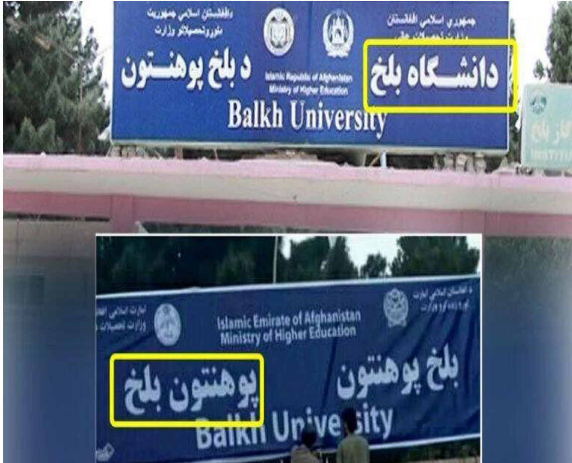
Taliban removed "Persian" words from banners at universities in Balkh Province. Photo Source: Social Media