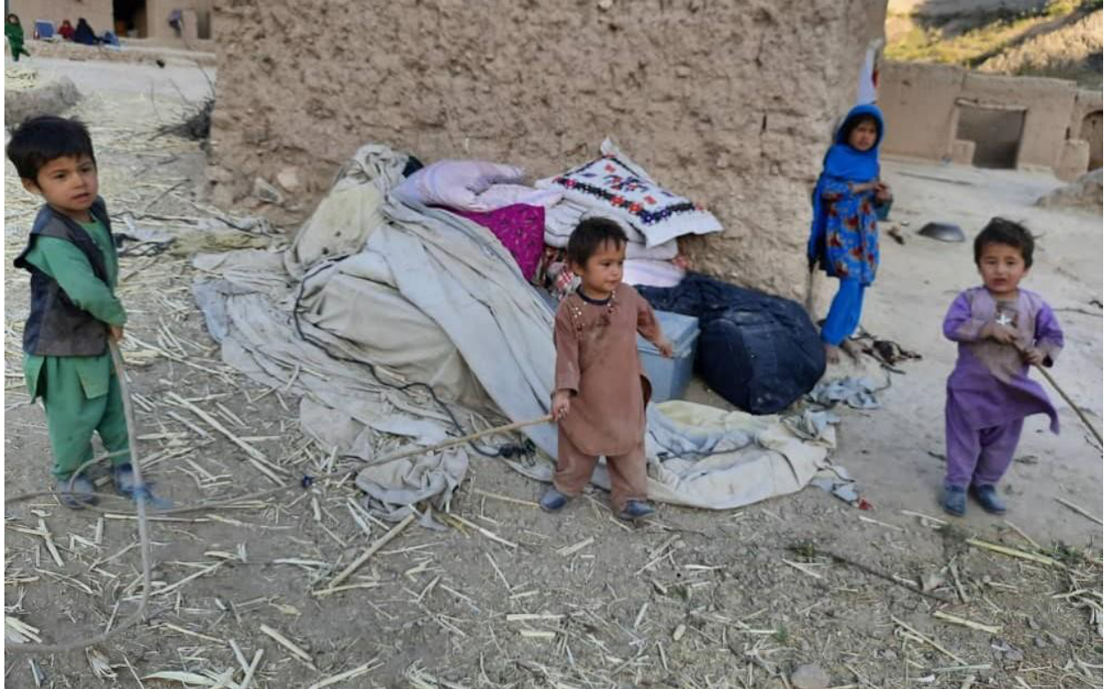
Taliban forced Hazaras to leave their properties in Daikundi province.