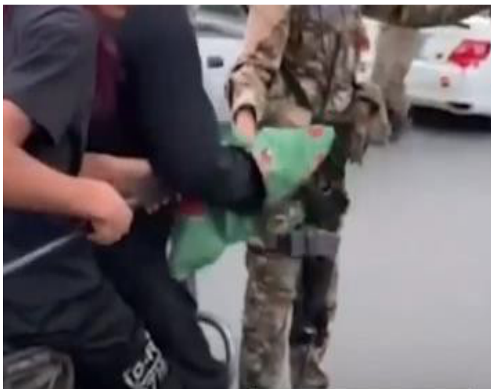
Taliban soldiers remove a banner from a religious ceremony of Shias during Ashura.

During the 2023 Ashura ceremony, the Taliban invaded Shia mosques to search for Shia religious leaders. One woman who participated in these gatherings said that Taliban soldiers even entered the women’s areas of the mosques and physically attacked Hazara women. She said she was very frightened. All the Hazara Shia women tried to escape, but the Taliban continued beating women and insulting Shias. One of the soldiers shouted at the crowd that, “We will kill all of you and we will kick you out of the country.”