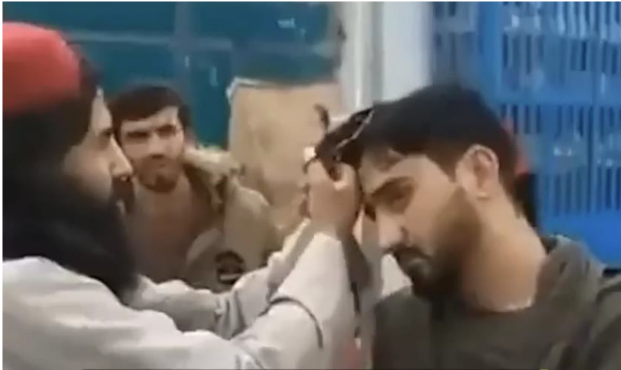
Taliban Ministry for the Propagation of Virtue and the Prevention of Vice cut hair of man on street as punishment.