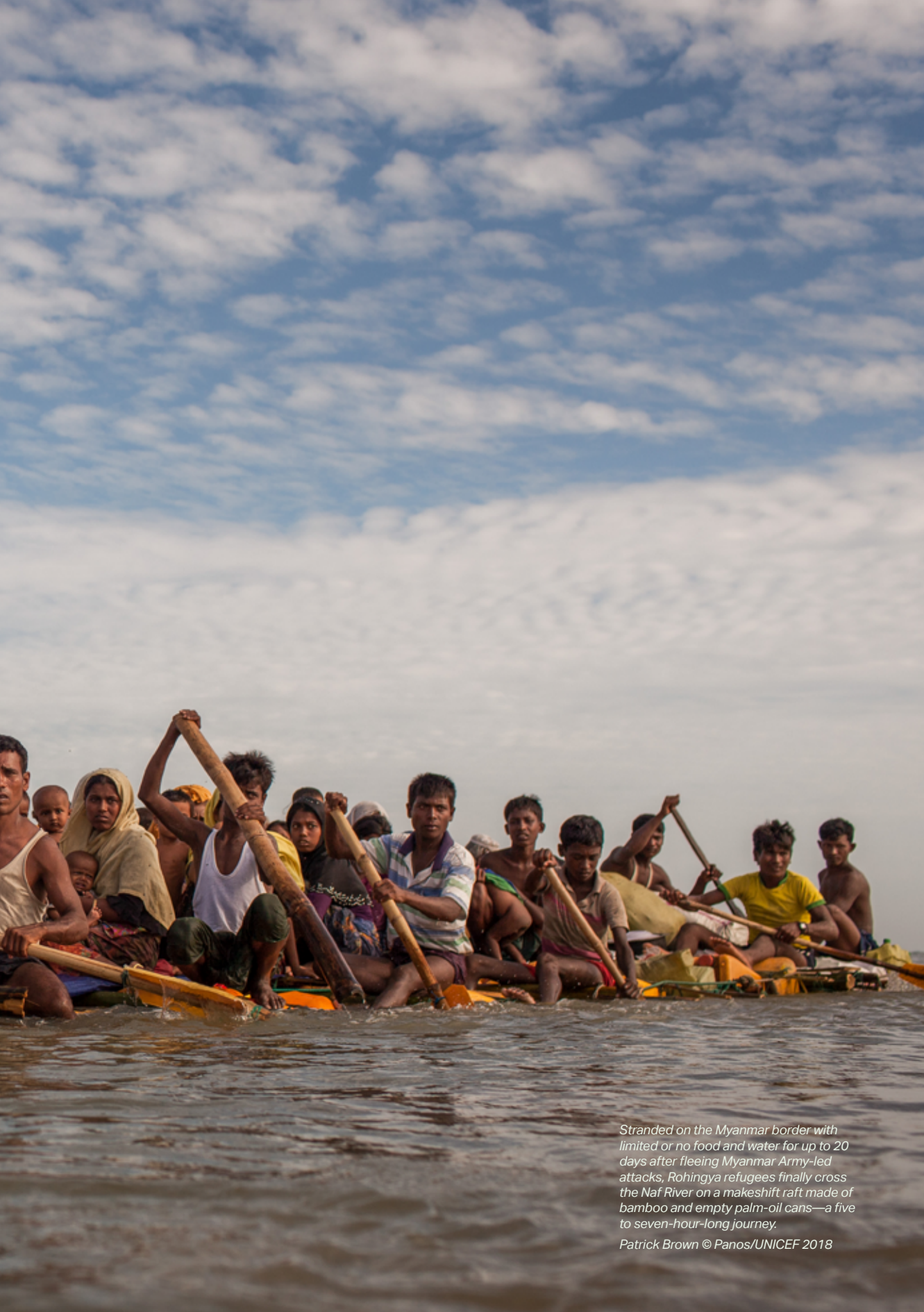
Stranded on the Myanmar border with limited or no food and water for up to 20 days after fleeing Myanmar Army-led attacks, Rohingya refugees finally cross the Naf River on a makeshift raft made of bamboo and empty palm-oil cans—a five to seven-hour-long journey.